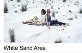
White Sand Area