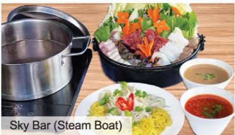
Sky Bar (Steam Boat)