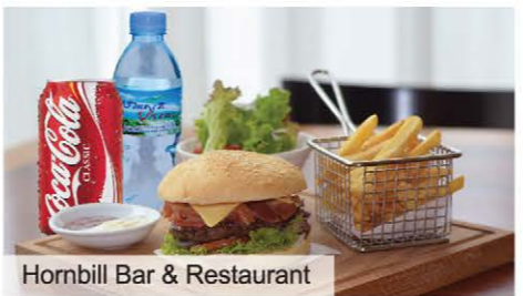
Hornbill Bar & Restaurant